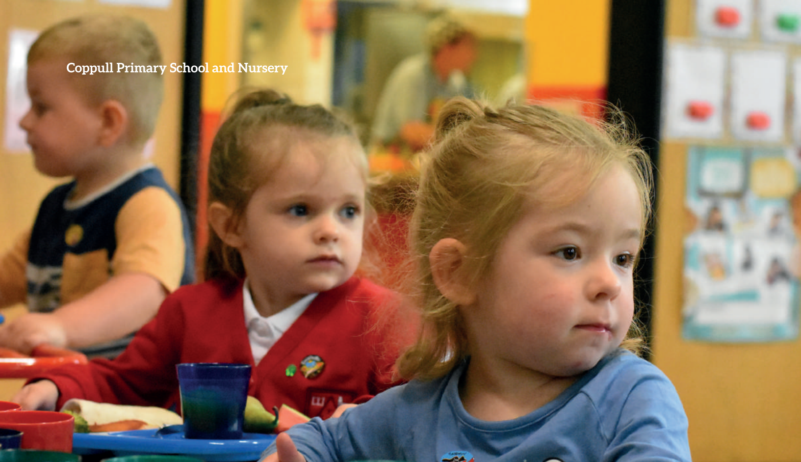
Above: Our 3 year old nursery children enjoying lunch